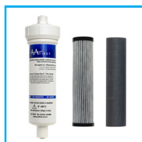
Filter Housing With Carbon Block Candle & Nanofilter.