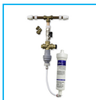
Installation Rail With Filter. Includes Compression Fitting, 1-Micron Green Filter, Water Block, Copper Pressure Reducing Valve & Non-Return Valve.